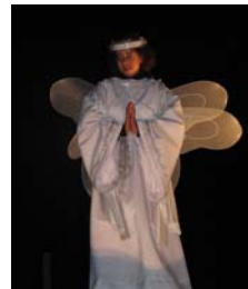
Thanks to our Youth for their live depiction of the Nativity.